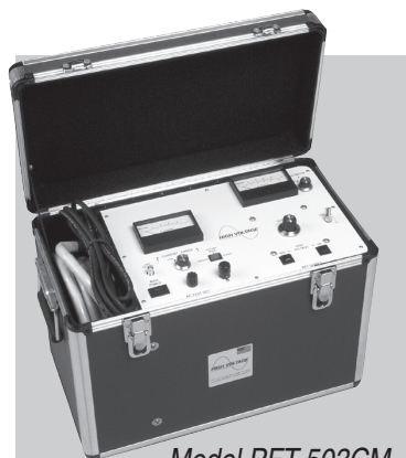
Model PFT-503CM (0-50 kVac)

0-10 kVac, 0-30 kVac, 0-50 kVac and 0-100 kVac