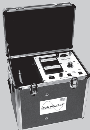
Model PFT-301CM (0-30 kVac)