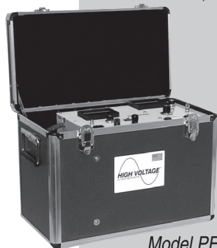
Model PFT-1003CM (0-100 kVac)